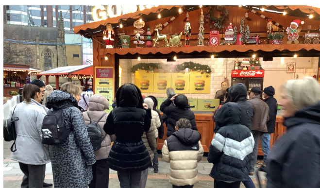
Students enjoying at The Leeds Christmas Markets

Over the course of two weeks, students from HCP visited the Leeds Christmas Markets. They explored the stalls in Leeds city centre and enjoyed a variety of festive food treats. Students also travelled using public transport, helping them practise independence and confidence. Many students said this was their favourite trip.