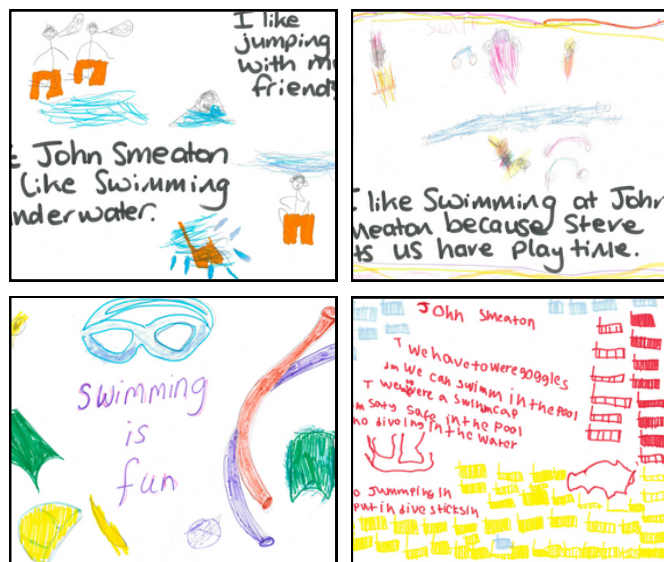
Posters made by students in create competition.

Swimming lessons are an important part of the curriculum across East SILC, with each group attending sessions at John Smeaton Leisure Centre for a term. These lessons take place on Wednesdays and give students the chance to develop water confidence, fitness, and swimming skills. This term, the students also took part in a poster-making competition related to swimming, and everyone expressed how much they enjoy their weekly trips to the pool. The lessons continue to be a fun and rewarding part of the school experience, helping students build confidence and teamwork both in and out of the water.