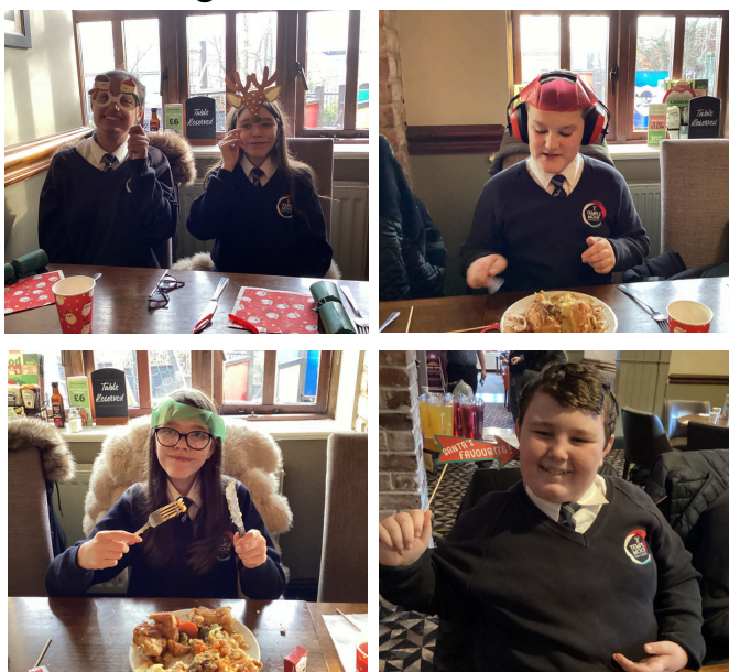
Students enjoying at Gildersome Arms

Every year, HCP has a tradition of going out for a Christmas carvery, which both students and staff look forward to. We travel together by minibus to the Gildersome Arms and enjoy getting into the festive spirit. This year, on 16th December, students enjoyed wearing Christmas-themed masks, popping crackers, and receiving small gifts. It was a lovely celebration and a great way to end the term together.