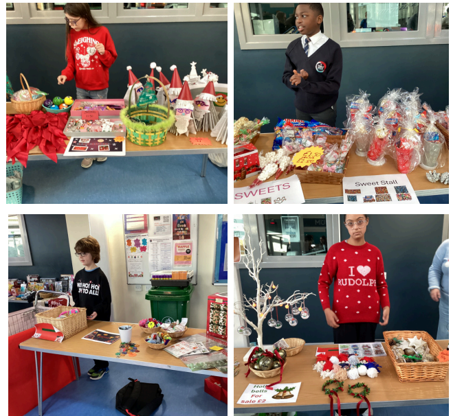
Students at different stalls during the Christmas fair