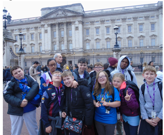
HCP Students at the Buckingham Palace

The highlight of the trip was entering Buckingham Palace through the main gate, making it a truly memorable experience.